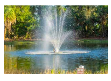
Fountains & Aeration Systems

Aeration is the one expense that can make the most improvement in the appearance and productivity of a lake or pond. Aeration systems increase the oxidation levels in the lake & get rid of harmful algae & insect larvae.