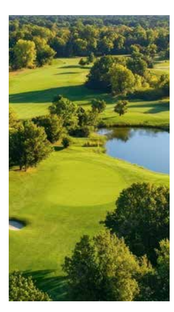
Golf Courses & Country Clubs